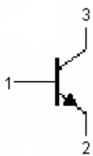
Fig. 1 Simplified Outline (TO-3) and Symbol

For use in horizontal deflection output stages for colour TV receives